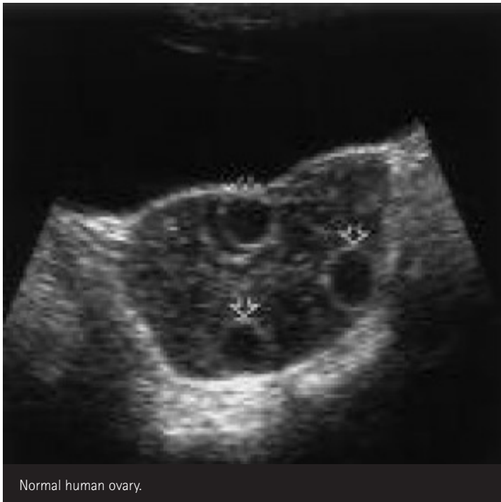
Normal human ovary.