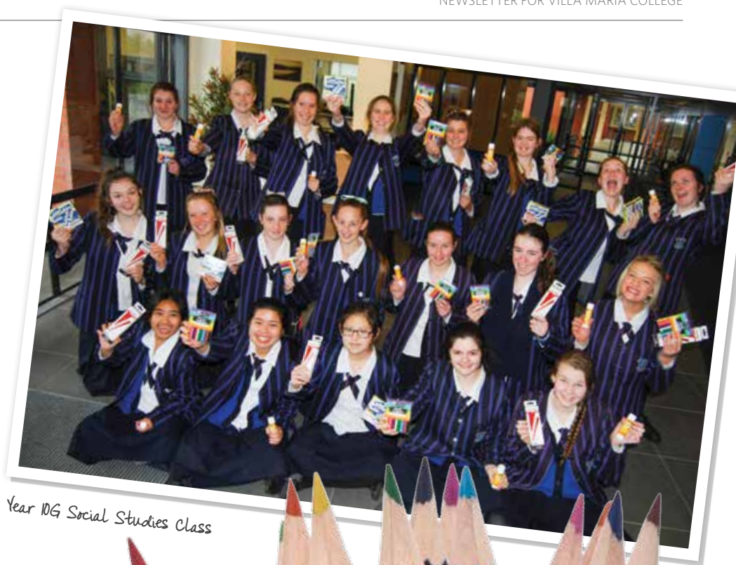
Year 10G Social Studies Class

10G students would also like to thank stationery supplier Eeny Meeny who donated 130 packets of crayons to go to the kids of Gilberthorpe School.