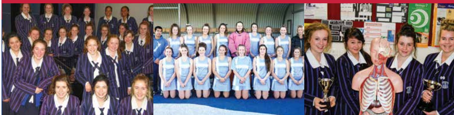
THE BIG SING 2013 • HOCKEY NATIONALS • BRAIN BEE CHALLENGE