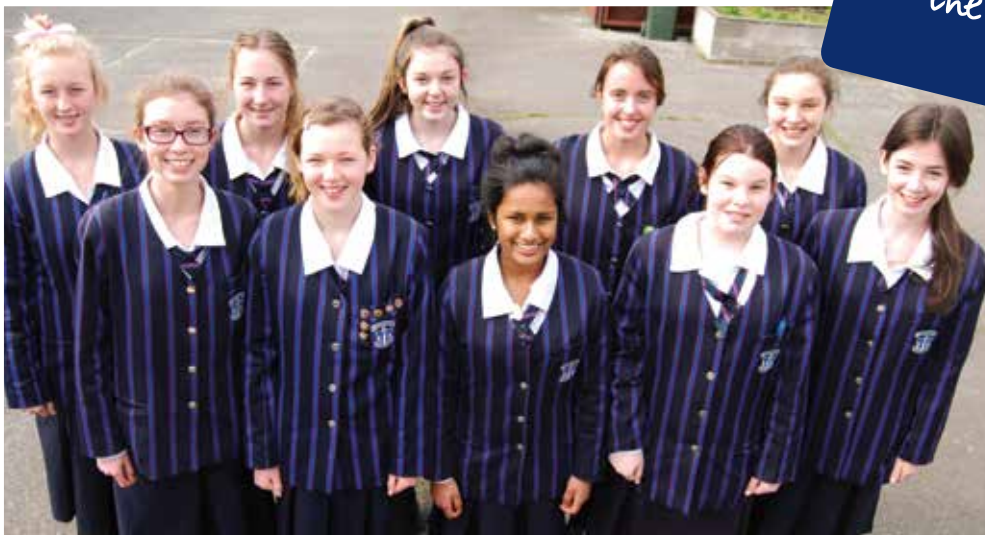
Vegemite Regional Spelling Bee Contestants

When it came down to the top eight, there were no boys left in the competition!!